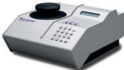
Fig. 1 AccuPyc 1330 Pycnometer