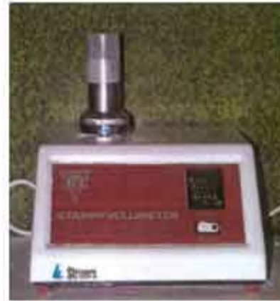
Fig. 2 Stampf-volumeter

The most recent version of this document is available at www.niro.com/methods